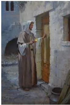
Behold, I stand at the door and knock.